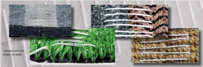
Samples are not drawn to scale