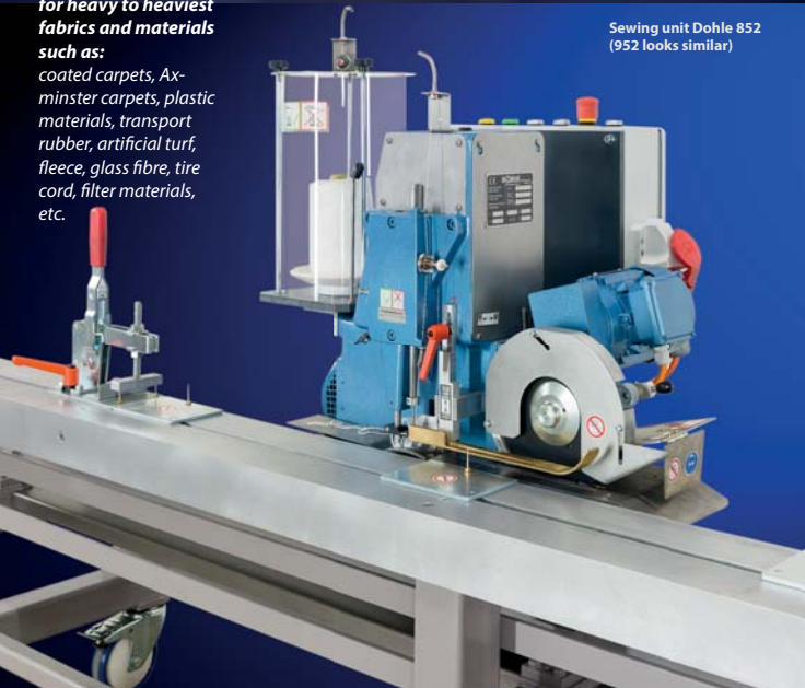
Sewing unit Dohle 852 (952 looks similar)

coated carpets, Axminster carpets, plastic materials, transport rubber, artificial turf, fleece, glass fibre, tire cord, filter materials, etc.